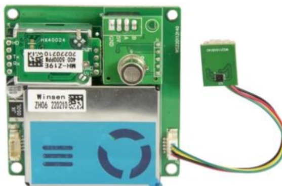
Fig2 : VOC version